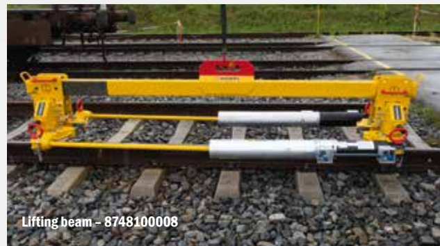
Lifting beam – 8748100008