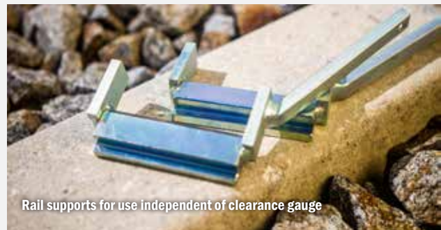
Rail supports for use independent of clearance gauge