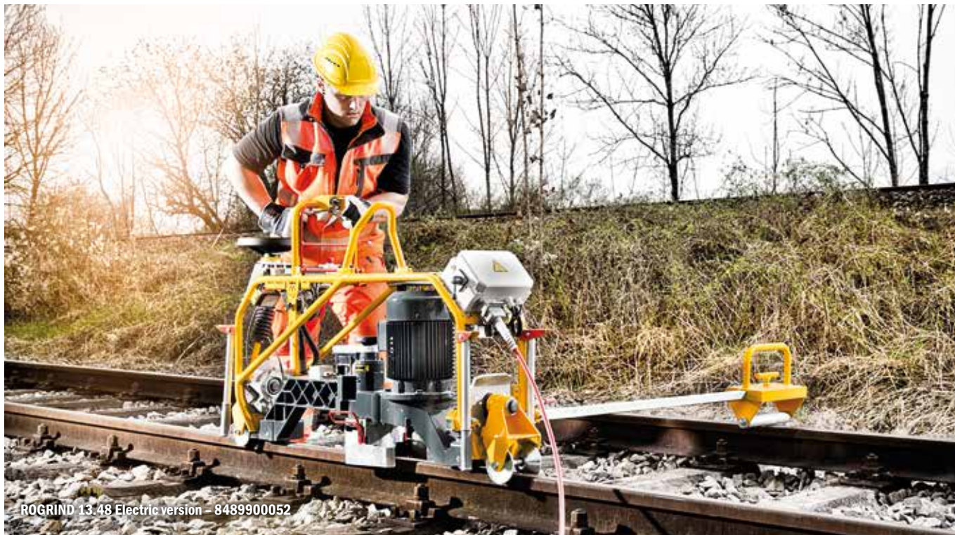
ROGRIND 13.48 Electric version – 8489900052