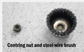
Centring nut and steel wire brush