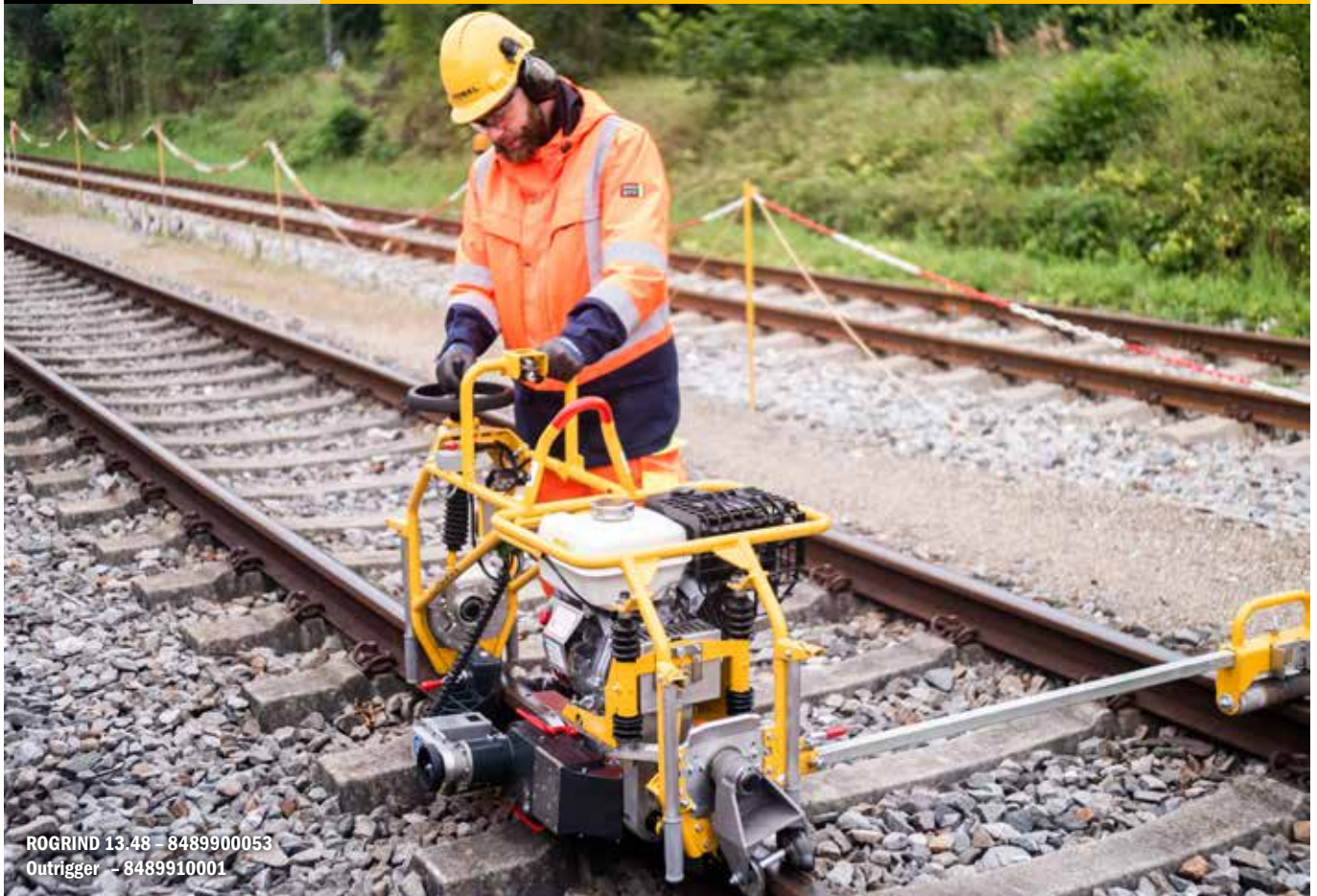
ROGRIND 13.48 - 8489900053 Outrigger - 8489910001

For true-to-form grinding of the rail head after welding work to restore a perfect profile.