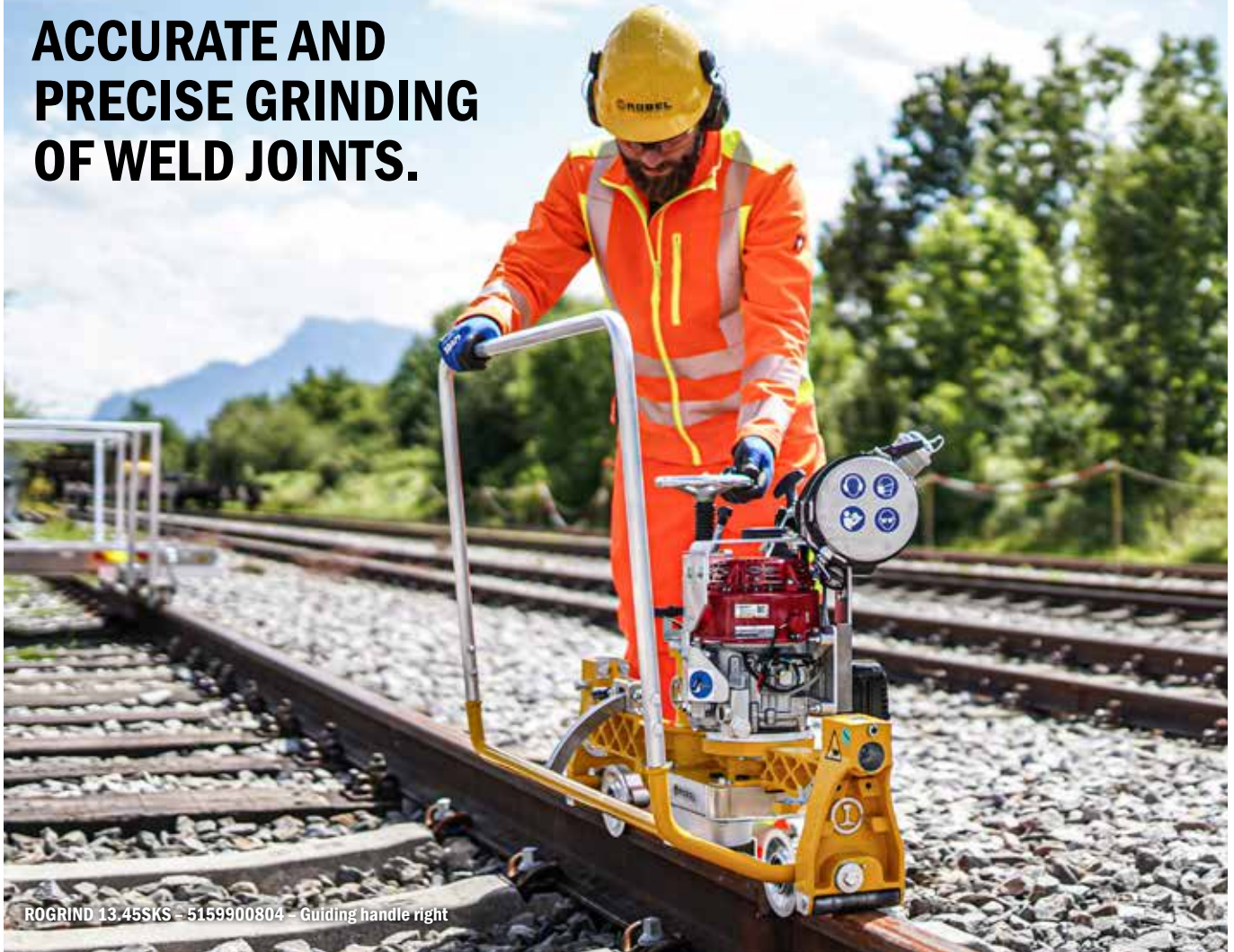
ROGRIND 13.45SKS - 5159900804 - Guiding handle right

The grinding machine for reprofiling the rail head.